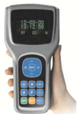
无线P II表 Wireless P II indicator