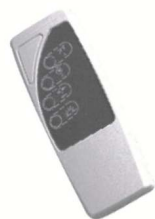
Remote Control 遥控器(可选)